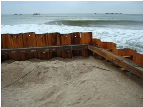
BRACING START IN THE DEBRIS REMOVAL COFFERDAM