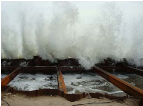
BRACING FINISH THE DEBRIS REMOVAL COFFERADAM