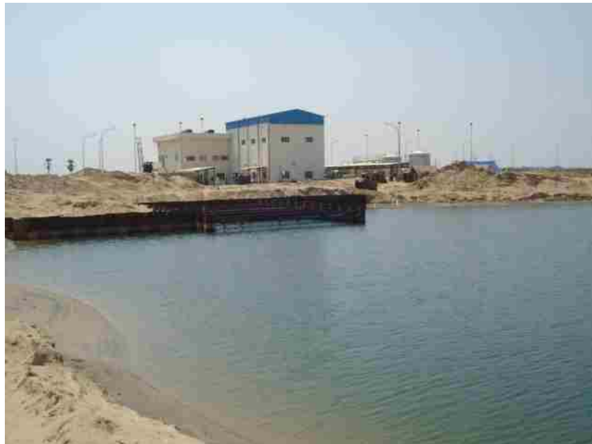
Temporary Cofferdam Work Completed and for Commissioning Work