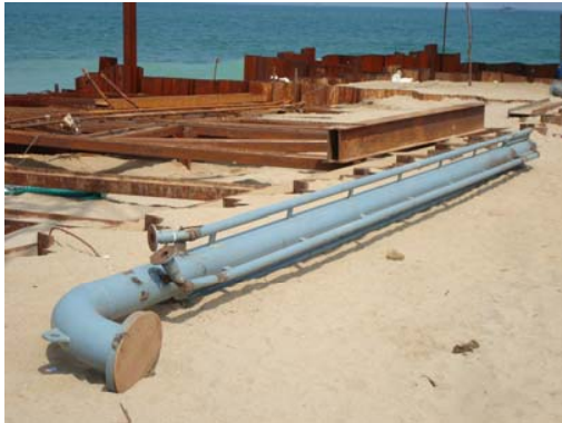
AIR DREDGE READY FOR DREDGING INSIDE COFFERDAM DEBRIS REMOVAL