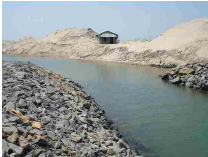
Temporary Lagoon Work Completed for Sea Water Intake