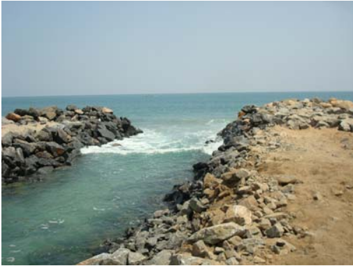
ENTRANCE LAKE CONTROL