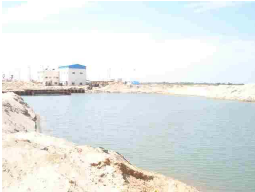
Temporary Sheet Piles were Erected in Sea Water Intake North Side for Commissioning Purpose