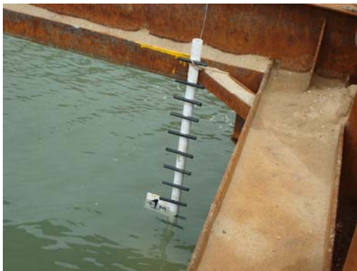
WATER LEVEL CONTROL