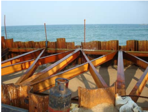
EXTRA BARCING IN THE REMOVAL DEBRIS COFFERDAM.