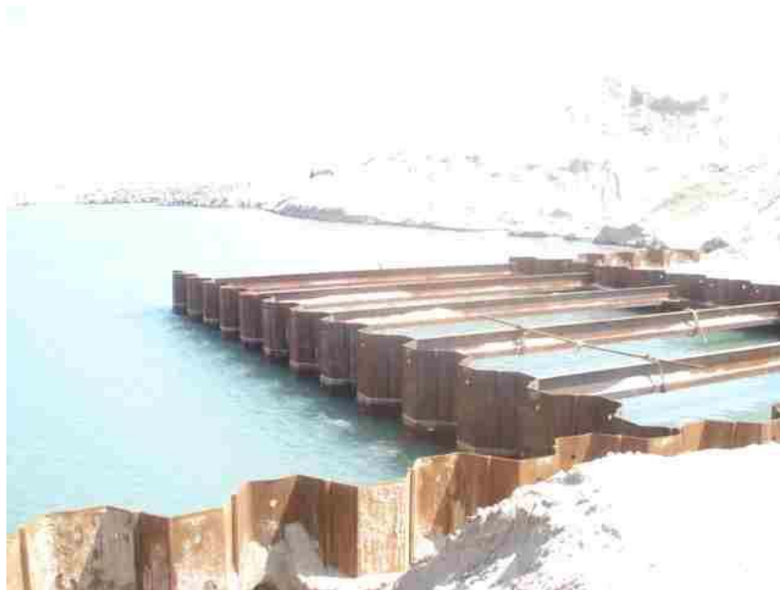
Temporary Sheet Piles were Erected in Sea Water Intake North Side for Commissioning Purpose