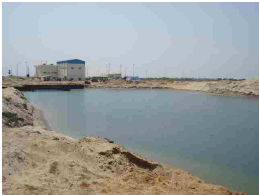
Temporary Cofferdam Work Completed for Sea Water Intake